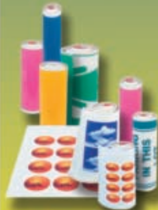
Roll Stock Materials