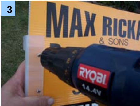
3 Securing signAclips Secure the signAclip in place by inserting 2 x 6 gauge screws into the clip. Do not over tighten screws.