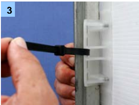
3 Slide the signAclip over a predrilled hole on the star picket, insert and tighten a single cable tie