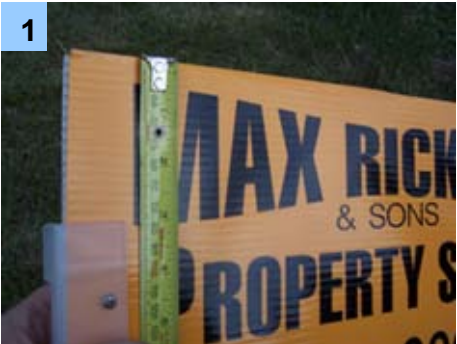
1 Positioning signAclips Fit each signAclip at the same measured distance from the top of each pointer sign.