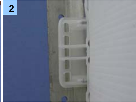
2 Position the curved section of the signAclip against the fin with the predrilled holes