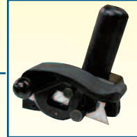
Shown as wall-mounted version

Double leverage clamping system provides secure and consistent clamping pressure on rigid and soft materials during the cut.